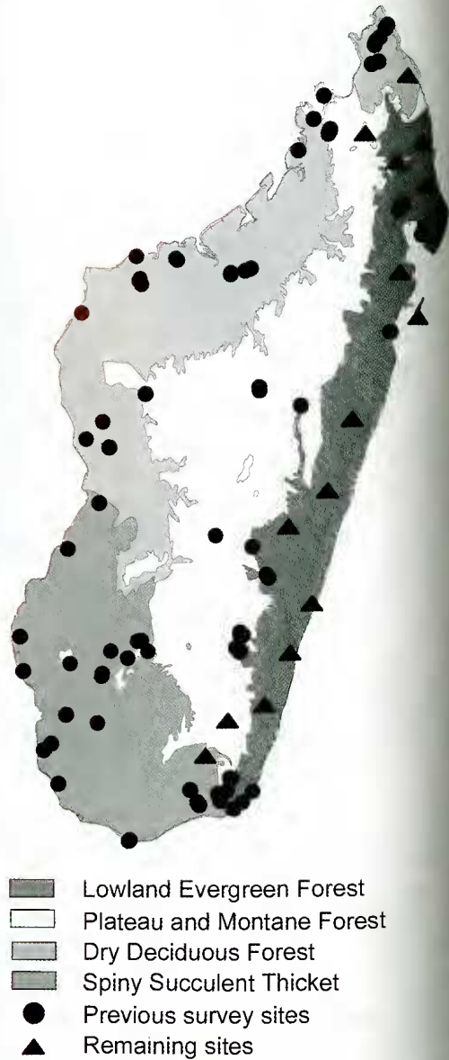
FIGURE 1. Madagascar: location of the 100 localities that were identified for field collecting

From 2000–2003, we estimate that more than 2 million arthropod specimens were processed and sorted to taxonomically accessible groups, and over 300,000 ants were pinned and labeled. Specimens were sorted at the processing facility in Madagascar and then sent to the California